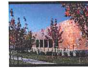
east elevation at addition