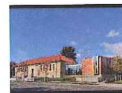
view of historic library & addition looking northwest