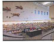
view of reference desk from stairs