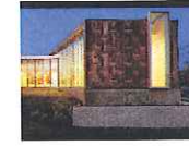
detail of addition