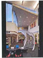
view of new reading room looking from reference desk toward historic building