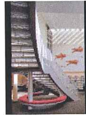
seating at staircase