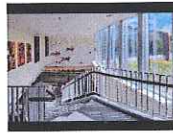
top of stairs to the new reading room looking east