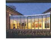
connector between historic building & addition