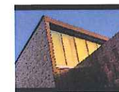
close-up of clerestory