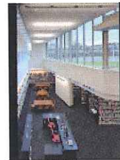
view from upper level meeting room into lower level reading room at addition