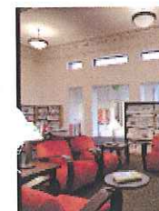
periodical lounge in historic building looking towards addition