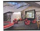
lounge seating & exhibit case in addition