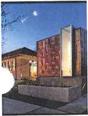
view of historic building & addition