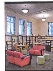
children's area in historic building