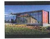
reflection of historic building in window wall of addition